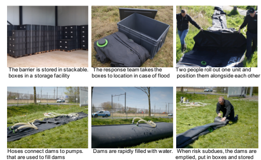
Figure 1: How to operate the technology

21. The SLAMDAM-technology is easy to operate, maintain and repair. It is therefore not complicated to enhance the skillset of people involved in flood risk management through trainings and capacity building workshops. The technology is simple yet highly effective in flood prevention. Once the local flood response team is trained, they are able to deploy the flood barrier independently.